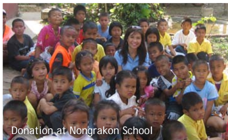
Donation at Nongrakon School

In cooperation with Akara Mining, LotusHall Mining provides charitable contributions to the poorer communities near Chatree Gold Mine, Phichit Province, Thailand.