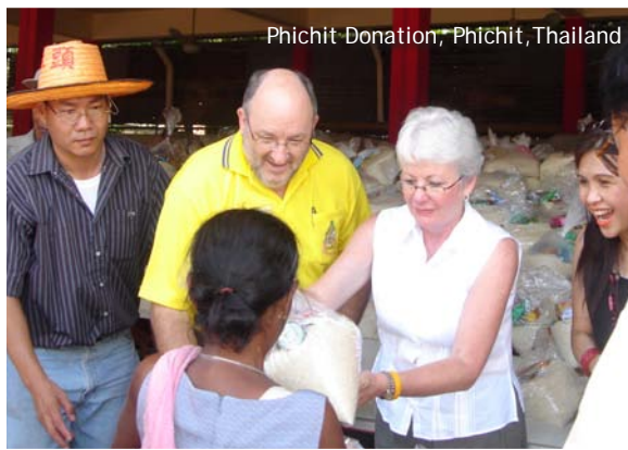
Phichit Donation, Phichit, Thailand

In cooperation with Akara Mining, LotusHall Mining provides charitable contributions to the poorer communities near Chatree Gold Mine, Phichit Province, Thailand.