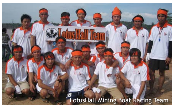
LotusHall Mining Boat Racing Team