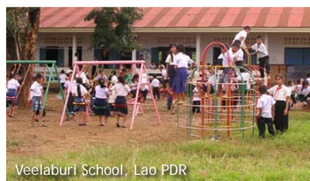
Veelaburi School, Lao PDR