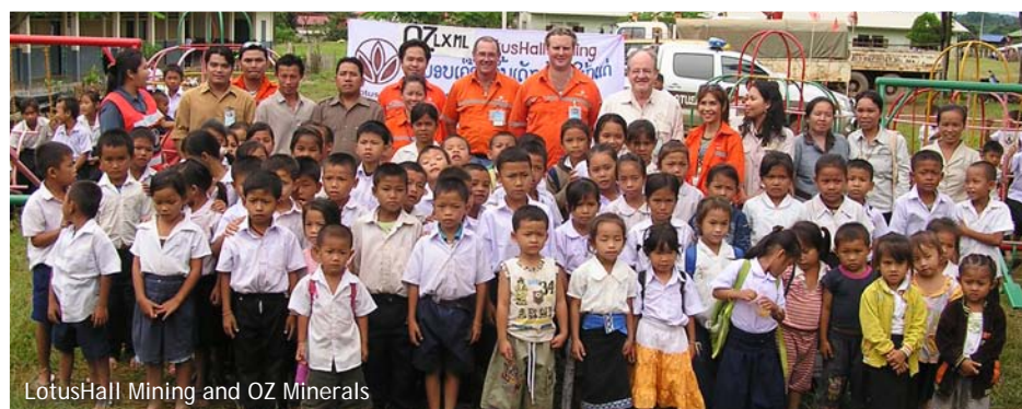
LotusHall Mining and OZ Minerals

Annual Boat Racing by the local communities at Sepon Gold & Copper Mine : LotusHall Mining organized a team that won the friendly competition between the locals and contractors in 2007.