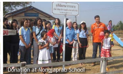
Donation at Nongjaprab School

On National Children's Day 2007, LotusHall Mining and Akara Mining donated a playground sets to the Nongchaprab School and the Nongrakhon School in Phichit Province, Thailand.