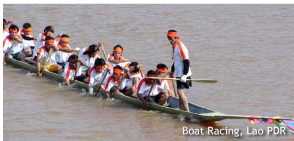
Boat Racing, Lao PDR

Annual Boat Racing by the local communities at Sepon Gold & Copper Mine : LotusHall Mining organized a team that won the friendly competition between the locals and contractors in 2007.